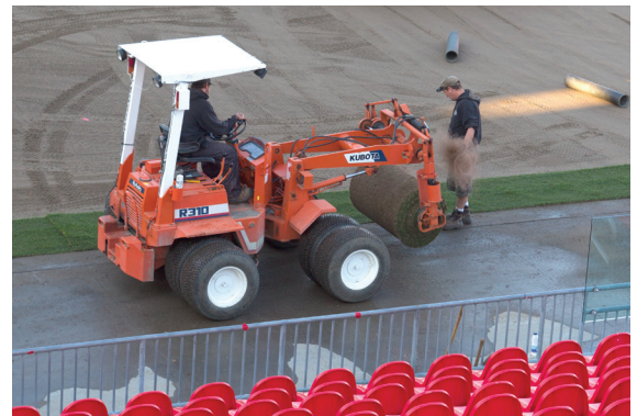
Greenhorizons specialty flotation installation equipment.